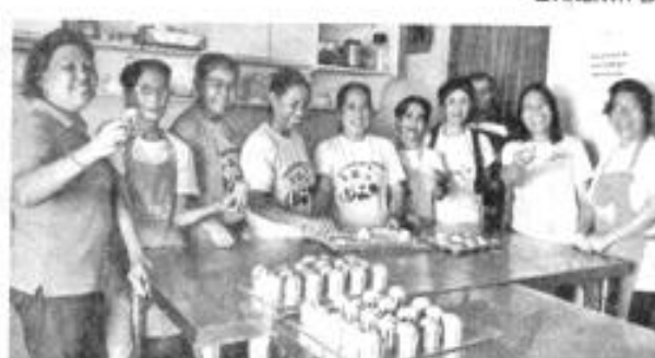
MEMBERS of the CPLA showing their products during the site visit in Binigawan.