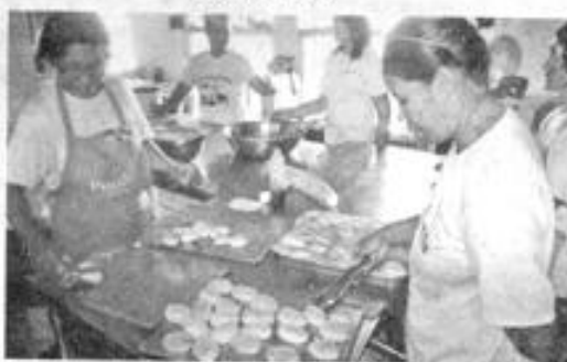
ASIDE from muffins, the parents also bake hot malunggay pandesal.