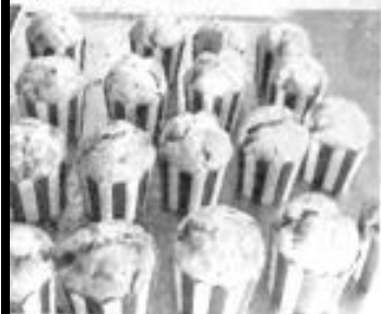
MEMBERS bake these organic banana muffins which are considered as best sellers in the town.