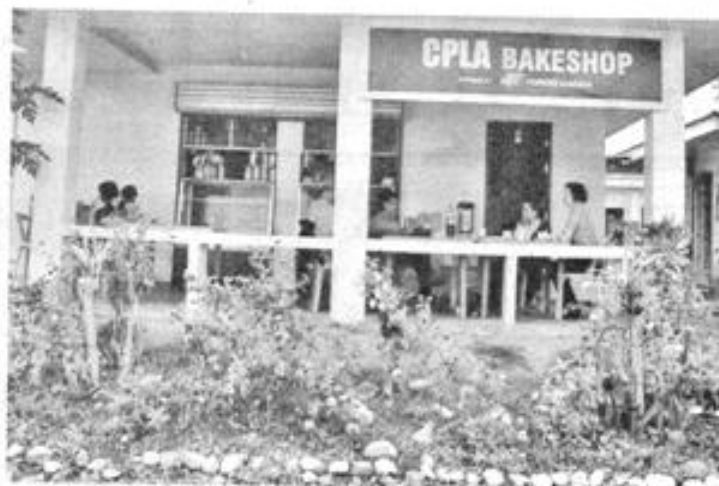
A GLIMPSE of the CPLA building funded by Cameleon.